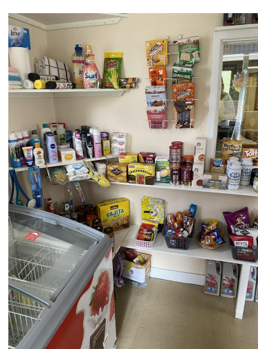
Items for sale