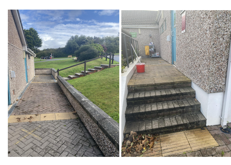
Steps around Toilet Block