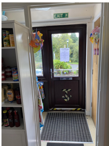
Entry into Reception