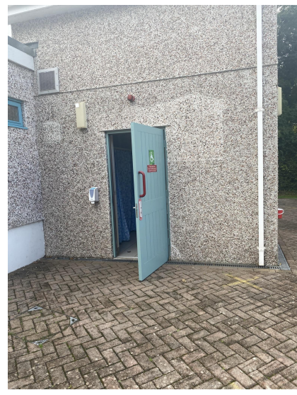
Entrance to Accessible WC and Shower Cubicle