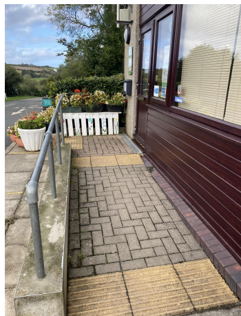
Ramp to reception